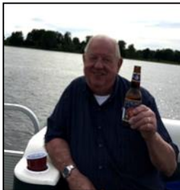
Enjoying life in Michigan